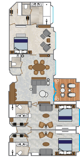
GRAND OWNER'S SUITE