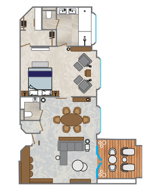
OWNER'S SUITE, MIDSHIP